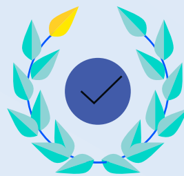
Status & Quality Check